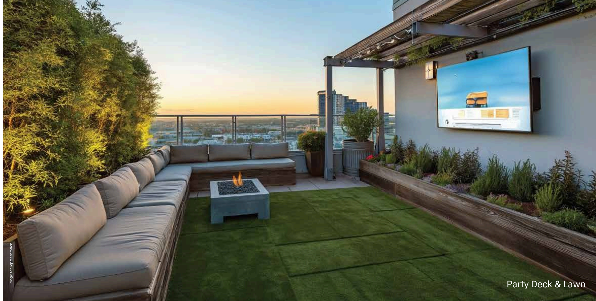
Party Deck & Lawn