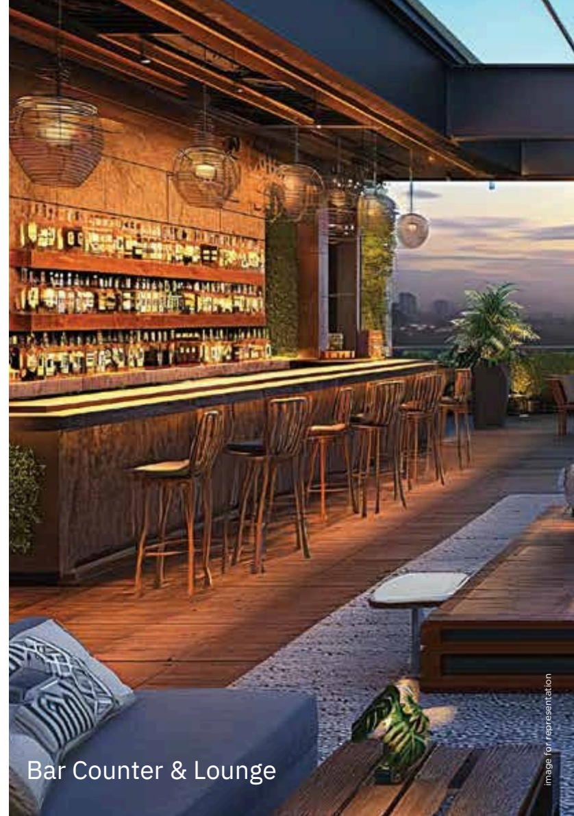
Bar Counter & Lounge